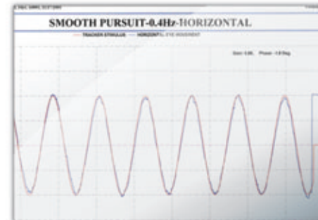
Smooth Pursuit Test