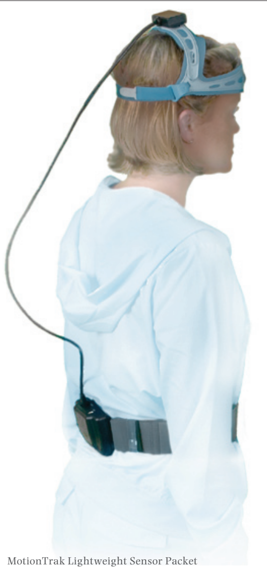
MotionTrak Lightweight Sensor Packet